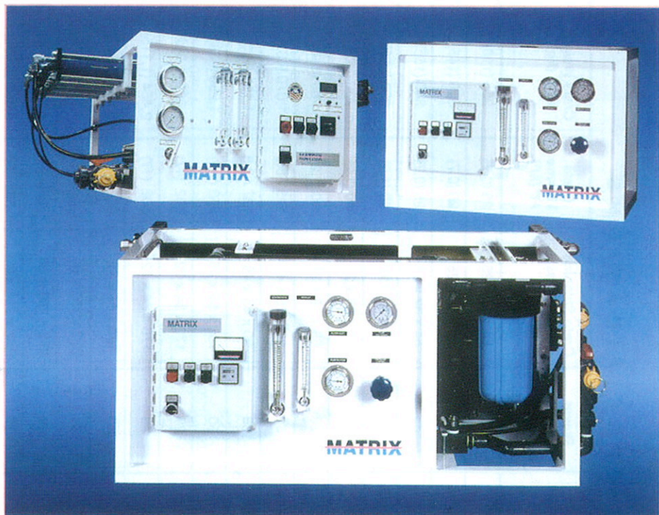
SILVER "A" AND "B"

M ATRIX Silver Series™ Watermaker systems are designed and built for applications where space, economy and reliability are of utmost importance.