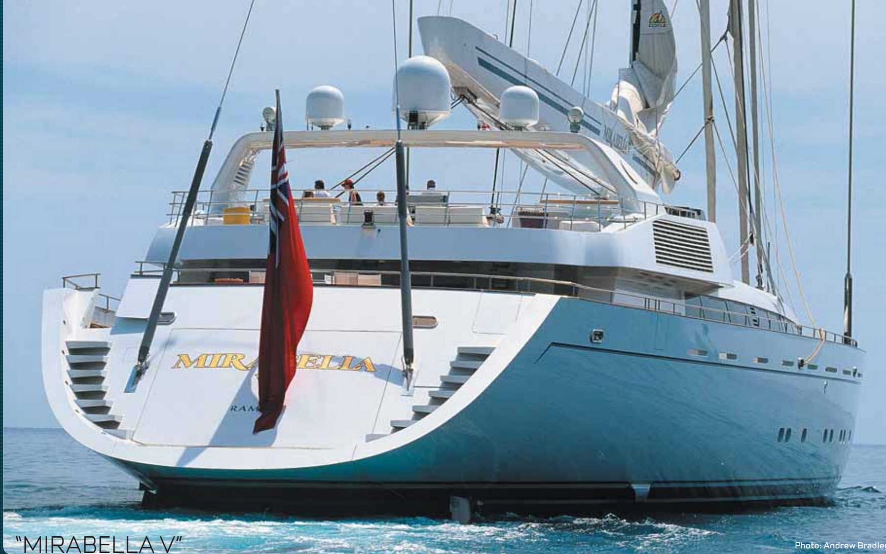
"MIRABELLA V" THE WORLD'S LARGEST SLOOP