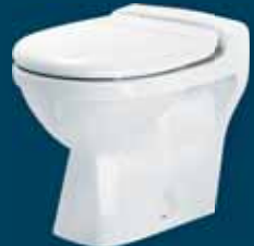
DECK-MOUNTED VITREOUS CHINA

Jets supplies a complete range of high-quality toilets for marine use.