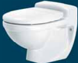
WALL-MOUNTED VITREOUS CHINA