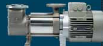
LARGE: JETS 65MBA