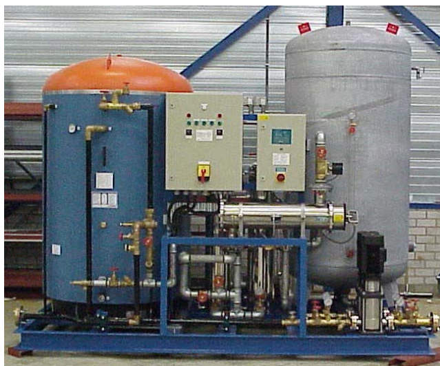
complete cold & hot hydrophore & treatment module

are interconnected with for the purpose suitable piping. All electrical parts are pre-wired to a local power control panel. Further the modules are equipped with all necessary interface connections.