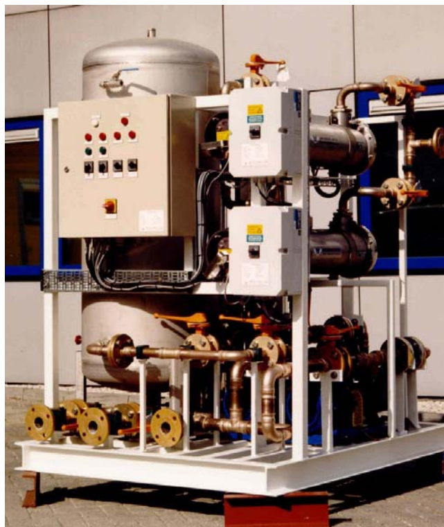
cold fresh water hydrophore & treatment module