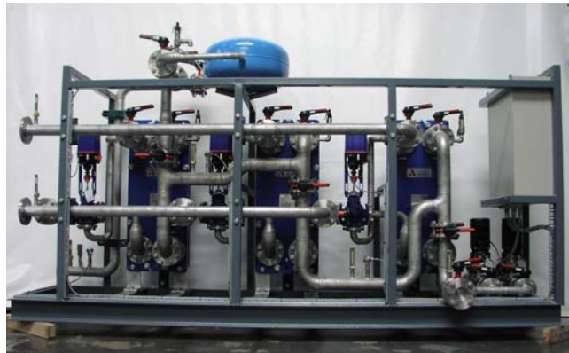
hot water module